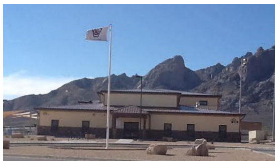
Youth Services (Bldg. 1318) (575) 678-7859