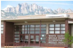
White Sands Elementary & Middle School

Please call to schedule early morning and late afternoon appointments.