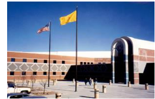
Onate High School

The School Liaison Officer works in conjunction with WSMR Child & Youth Services and the Las Cruces Public Schools to address educational issues involving military children. Through partnering with the local and military community, the School Liaison Officer can help with the full range of K-12 schools (public, private, & home school), and also with college and trade school information. For more information regarding the School Liaison Office, please call 575-678-7093.