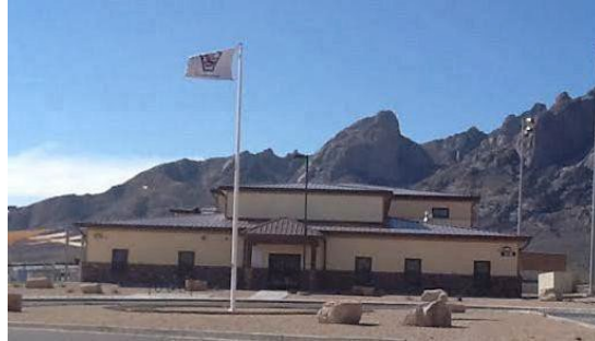
Youth Services (Bldg. 1318) (575) 678-7859