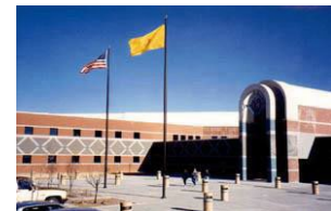
Organ Mountain High School

The School Liaison Officer works in conjunction with WSMR Child & Youth Services and the Las Cruces Public Schools to address educational issues involving military children. Through partnering with the local and military community, the School Liaison Officer can help with the full range of K-12 schools (public, private, & home school), and with college and trade school information. For more information regarding the School Liaison Office, please call 575-678-2708, or 575-288-5811.