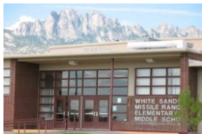
White Sands Elementary & Middle School

Please call to schedule early morning and late afternoon appointments.