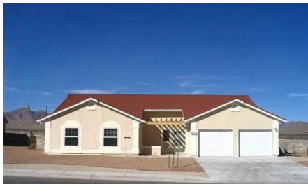
Family Child Care (Bldg. 272) (575) 678-0585 Office Hours Vary

Family Child Care (FCC) providers offer small group care in a family environment for children 4 weeks to 12 years of age. It is important that parents establish a good relationship with FCC providers. Ask questions and provide all the information needed about your child and family so that the FCC Provider can have the information needed to provide quality care. FCC homes are certified when training, background clearance, fire, safety, and health inspections are passed. On-going trainings and inspections help maintain quality childcare in each home. Parents must be registered with Child & Youth Services to use the FCC program.